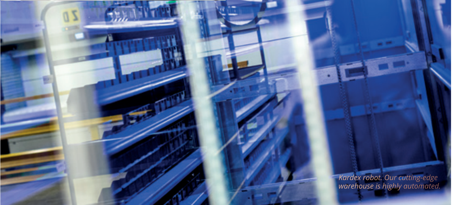
Kardex robot. Our cutting-edge warehouse is highly automated.